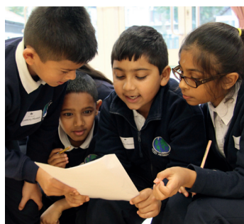
New workshops for Unicorn school's programme

For more information visit http://unicorntheatre.com/schools/interact or contact Unicorn's schools relationship manager: ella.macfadyen@unicorntheatre.com ; 020 7645 0544.